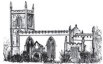
St. Peter's Church, Everleigh

At the Parish Council meeting held on 2nd November, and reported on elsewhere in this edition of the Courier, concern was raised by a member of the public about the continuing obstruction of a water bowser being regularly filled at West View. The Police have been advised and it is hoped that the matter can be resolved amicably with the farmer involved.