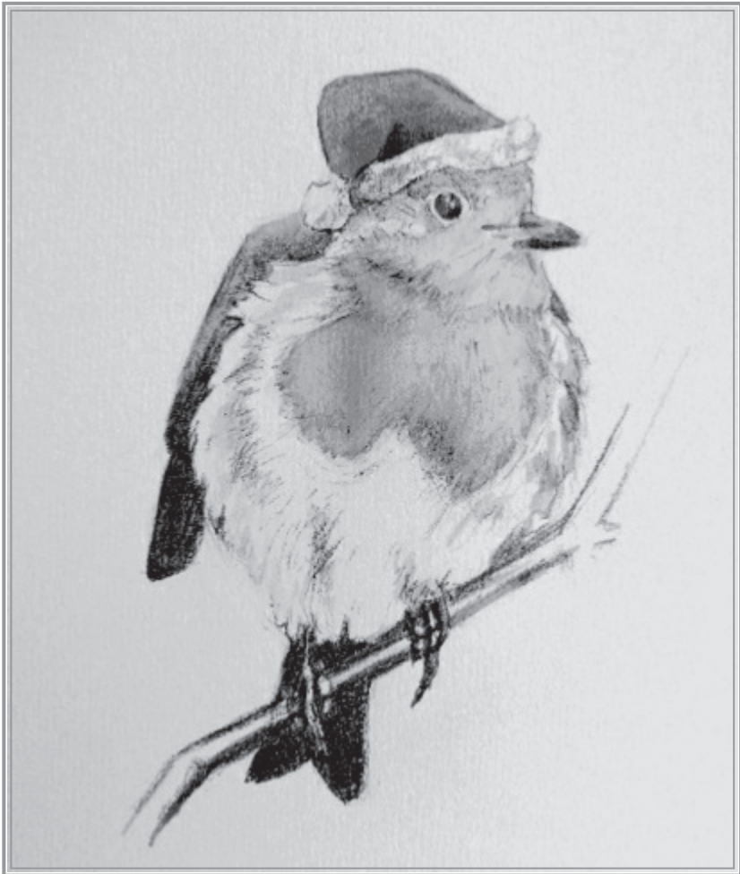
Santa Robin Brings Good Wishes