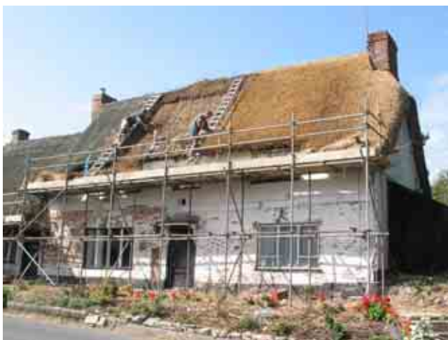
At the heart of Collingbourne Kingston

From its original compact core of dwellings recent decades have seen an extension of the settlement southwards in a ribbon along the western side of the A338 with smaller east and west extensions along Mill Drove and Chapel Lane. The old Village core has been designated as a Conservation Area which embraces both important historic survivals and more mundane 20 th Century buildings with which they are juxtaposed.