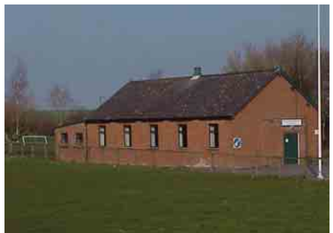
Our Village Hall