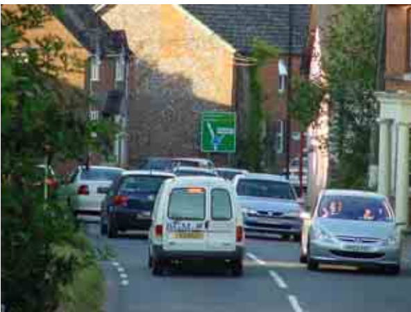
Sunday evening traffic

Whilst 27% of residents work and attend school in the Village and adjoining Collingbourne Ducis, over 50% of people travel to places of work beyond the distance of our local towns (such as Swindon or Andover). 73% of residents never use the bus service and 66% of those believe it requires improvement. 80% of Villagers travel to work and places of education using cars. In sum road communications are important to the Village.