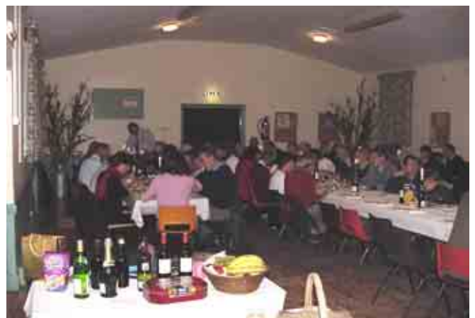
Harvest Supper in our Village Hall - 2003