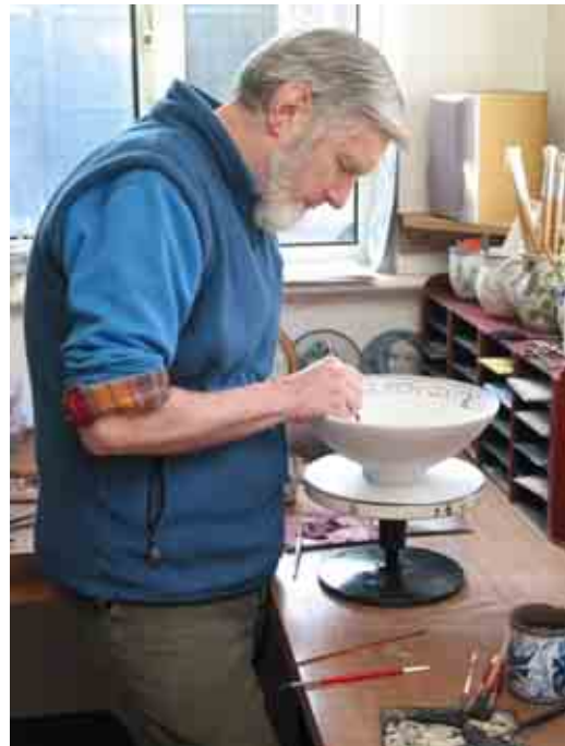
Self employed