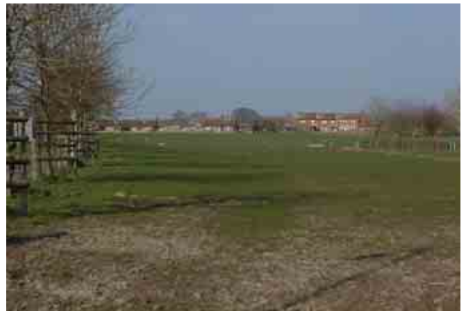
View over the ground separating the Hamlets

This supposed ethos of isolationism is not manifest in the spirit within the community. We have just one Parish Council representing the whole community. Our Church and Village Hall sit at the centre and heart of the Village and both are regular and popular meeting places for people from all three parts of the Village. Indeed the Clubs and Societies using the Hall do not discriminate. The Hall is used on most days of the year.