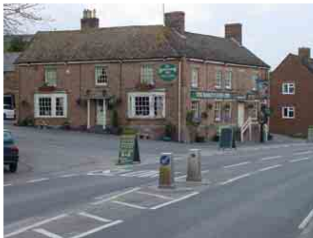
The Barleycorn Inn

Of the service buildings in the settlement, one Public House remains in business whilst the second is now a private residence, as is the one-time shop, Post Office and Bakery. Likewise, the fine old school building, having enjoyed a second life as a restaurant now caters solely for Bed and Breakfast clients. In the southern extension to the settlement a petrol and service station serves local and passing needs.