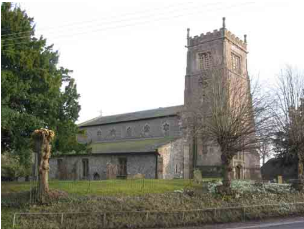
St Mary's Church – The central focus of our Village.

Cover panoramic view of the whole Village created by Sonny Hamid