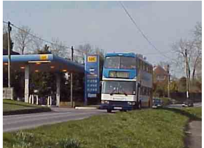
The infrequent bus service

Nevertheless the growth in entertainment and communication through the use of the internet has not passed by our Villagers. Several respondents in the Survey declared that they conduct their shopping through the use of the internet (although some stores do not deliver to the Village). Unfortunately our three hamlets are not well served. We cannot receive broadband services, some terrestrial television services are not available nor is the BBC’s FREESERVE facility.