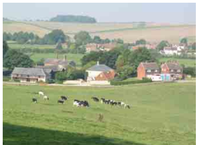
Different styles of building in Brunton

Of the three settlements only Brunton retains something of the feeling of living in the midst of a working agricultural village and still enjoys something of the feel of a peaceful backwater. Nearly all the settlement lies within a Conservation Area and has suffered little from intrusive development. Indeed it has exemplars, at the foot of Tinkerbarn Hill, of the successful conversion of redundant farm buildings to residential use, sitting comfortably alongside a sympathetically considered new construction. Another example of a conversion lies opposite Brunton Farm House. Brunton House itself is the highest status building in the settlements and is probably the only one designed by an architect pre 20 th Century. Again under the restrictions of policy HC24 the constraints of the settlement limits as defined by the existing built line would seem to preclude much opportunity for further infilling.