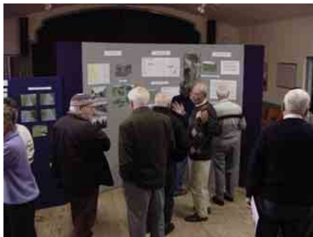
The Survey results are displayed at an Open Evening

Furthermore, in the spring of 2003, the whole community (213 households) was canvassed for views on a range of issues, some of which are beyond the scope of this statement. Responses to this postal survey were provided from over 53% of the total households within the three hamlets. 5 In April 2003 an Open Evening was held in our Village Hall to announce the findings of the survey and to provide an opportunity for further comment on the survey; some 30 people attended this event. In sum, in drawing up this Statement wide involvement has been encouraged, sought and received; we are confident that this reflects the true wishes of the community as a whole.